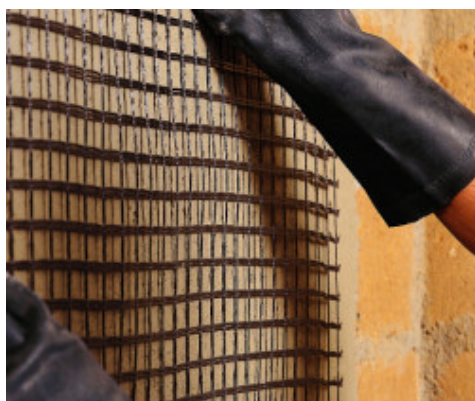
Positioning of Mapegrid G 220