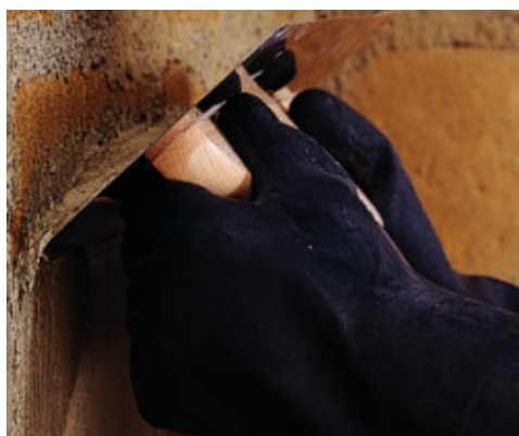
Application of the first layer of Planitop HDM Maxi

any “debonding” phenomenon and increases the static efficiency of the strengthening package applied. The number and pitch of the connectors is defined during the design phase.